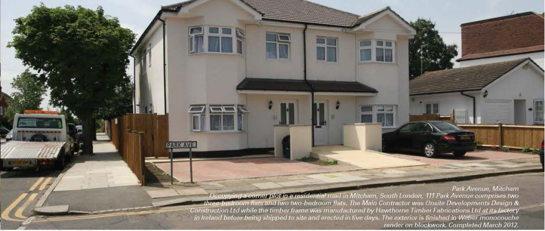
Park Avenue, Mitcham Occupying a corner plot in a residential road in Mitcham, South London, 111 Park Avenue comprises two three-bedroom houses and two two-bedroom flats. The Main Contractor was Onsite Developments Design & Construction Ltd while the timber frame was manufactured by Hawthorne Timber Fabrications Ltd at its factory in Ireland before being shipped to site and erected in five days. The exterior is finished in Weber manocouche render on blockwork. Completed March 2012.

best professional service including the interpretation of local authority housing strategies, sympathetic aesthetics and advising on innovative ways of using modern materials and technologies whilst addressing the latest concerns over sustainable development and energy efficient building design. Through a difficult economic climate, Alex Coleman Associates have remained optimistic and succeeded in maintaining a steadily increasing workload with much