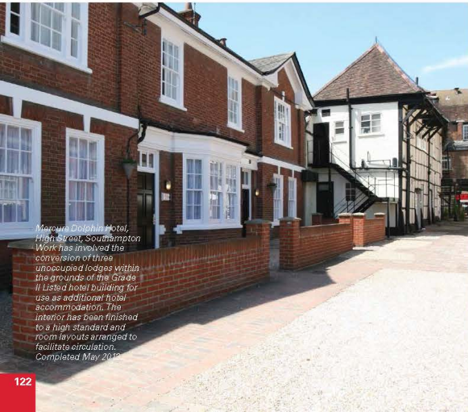
Meroua Dolphin Hotel, High Street, Southampton Work has involved the conversion of three unoccupied lodges within the grounds of the Grade II Listed hotel building for use as additional hotel accommodation. The interior has been finished to a high standard and room layouts arranged to facilitate circulation. Completed May 2012